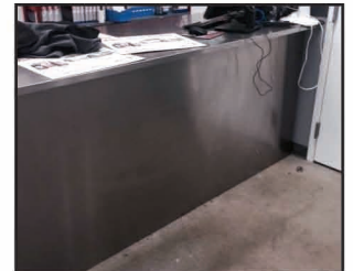
Painted Or Stainless Steel Front Cover Panels Available - Sold Separately