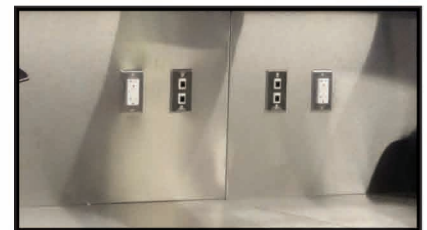
Electrical Duplex & Data Cut-Outs