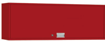
Model #791443 - 60"W