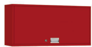
Model #791442 - 36"W