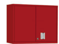
Model #791641 - 24"W