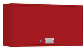
Model #791733 - 30"W