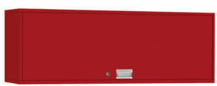
Model #791548 - 58 5/16"W