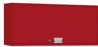
Model #791745 - 45 3/4"W