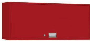
Model #791457 - 48"W