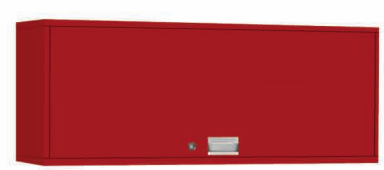
Model #791735 - 52"W