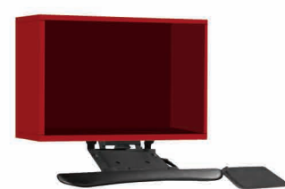
Model #791438 - 24"W