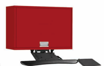
Model #791438-39 - 24"W With Slide-In Retractable Door

Upper Storage Cabinets, Dual Swing-Out Door Upper Storage Cabinets & Monitor Cabinets Are 15"D x 18 9/16"H