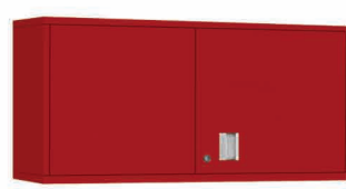
Model #791642 - 36"W