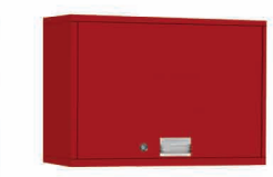
Model #791595 - 24"W