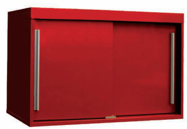
Model #800030 - 48"W