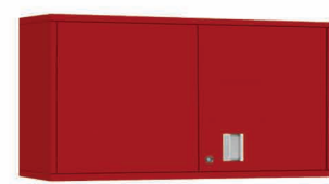
Model #791644 - 30"W