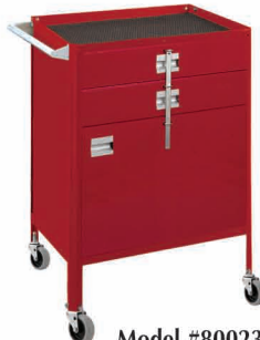
Model #800236 Mini Deluxe Technician Cart