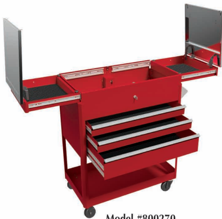
Model #800270 Premium Elite Technician Cart