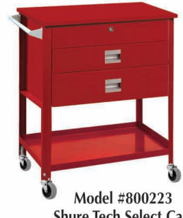
Model #800223 Shure Tech Select Cart