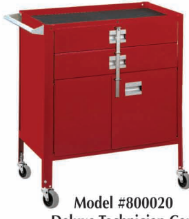
Model #800020 Deluxe Technician Cart