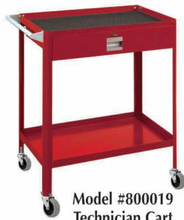
Model #800019 Technician Cart