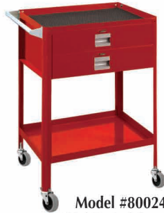
Model #800247 Mini Technician Cart With (2) Drawers