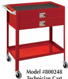
Model #800248 Technician Cart With (2) Drawers