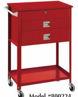
Model #800224 Tall Technician Cart