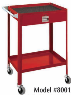
Model #800129 Mini Technician Cart