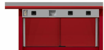
Model #791478 5' - Wall-Mounted