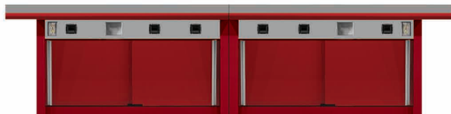
Model #791446E - 10' - Wall-Mounted