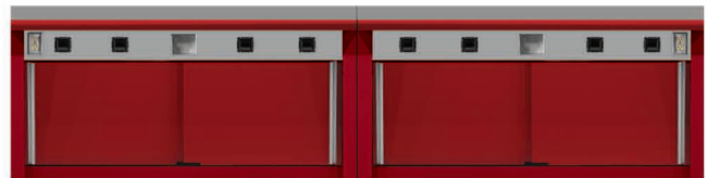
Model #791434 - 10' - Wall-Mounted