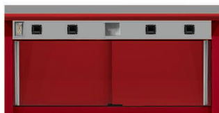
Model #791489 5' - Wall-Mounted