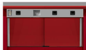
Model #791466 4' - Wall-Mounted