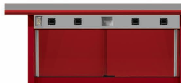
Model #791389 6' - Wall-Mounted