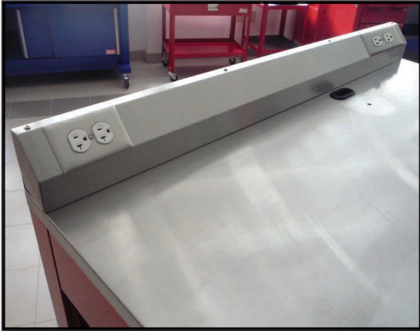
Stainless Steel Electrical Power Backstops