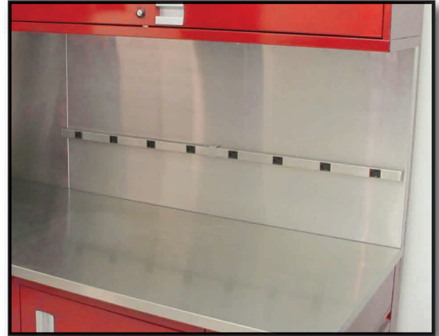
Stainless Steel Electrical Power Strips