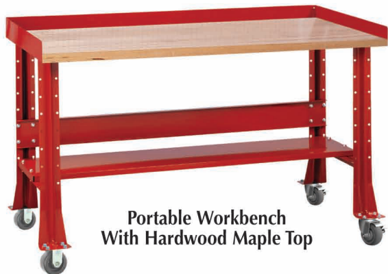
Portable Workbench With Hardwood Maple Top