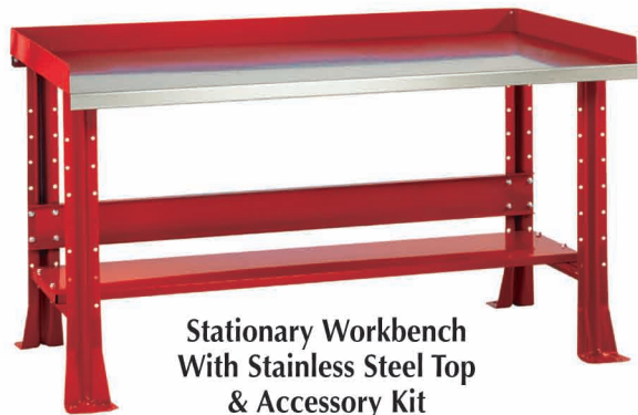
Stationary Workbench With Stainless Steel Top & Accessory Kit