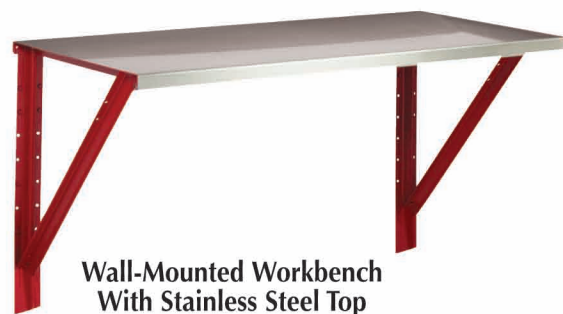
Wall-Mounted Workbench With Stainless Steel Top