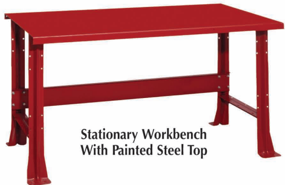
Stationary Workbench With Painted Steel Top