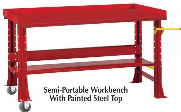
Semi-Portable Workbench With Painted Steel Top