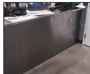
Painted Or Stainless Steel Front Cover Panels Available - Sold Separately