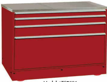
Model #TS7091 Concealment Skirts