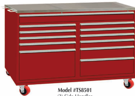
Model #TS8501 (2) Side Handles