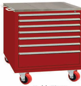
Model #TS8035 (2) Side Handles