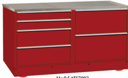
Model #TS7092 Concealment Skirts