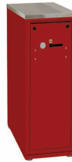
Model #SPU-12CA Challenger AquaVantage™