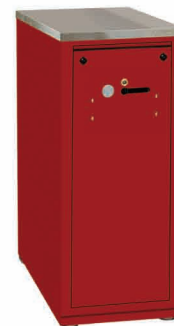
Model #SPU-14CASO Challenger AquaVantage™