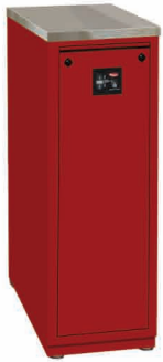
Model #SPU-12RI Rotary® SmartLift®