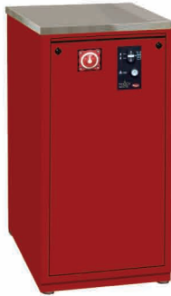
Model #SPU-SW Rotary® Shockwave™