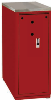
Model #SPU-14RMSO Rotary® Mechanical