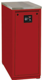
Model #SPU-14RISO Rotary® SmartLift®