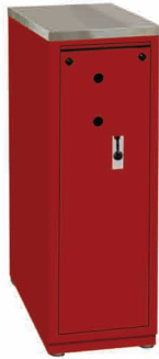
Model #SPU-12RM Rotary® Mechanical