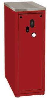
Model #SPU-12CM Challenger Mechanical