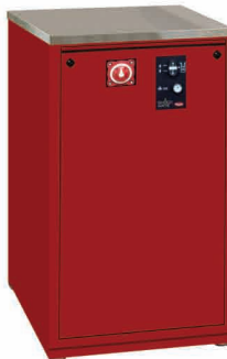
Model #SPUSW-SSO Rotary® Shockwave™