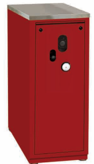
Model #SPU-14CMSO Challenger Mechanical