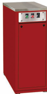
Model #SPU-14CPSO Challenger Push-Button