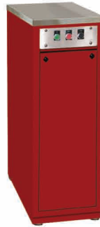
Model #SPU-12CP Challenger Push-Button