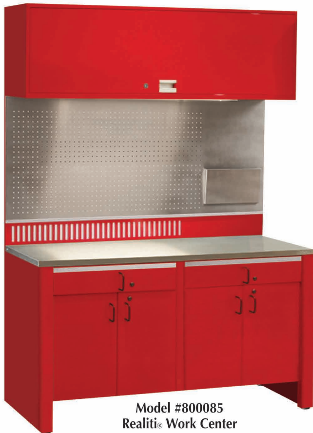
Model #800085 Realiti ® Work Center