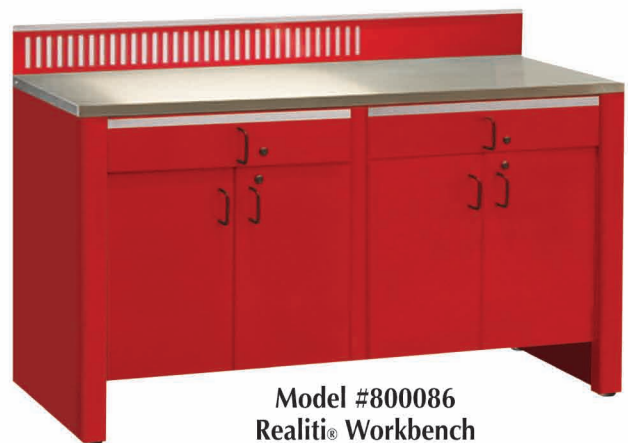
Model #800086 Realiti ® Workbench