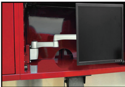
Model #900810 Monitor Extension Arm