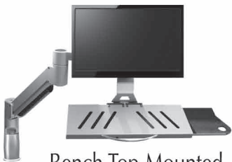
Bench Top Mounted