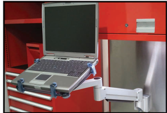
Model #900840 Laptop Extension Arm