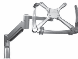
Bench Top Mounted