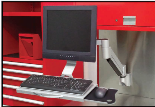
Model #900839 Flat Panel Monitor Extension Arm With Keyboard Holder