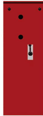
Model #791487 Rotary® Mechanical