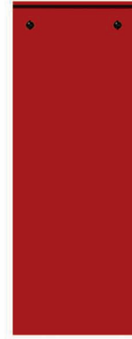
Model #791543 Solid / Plain