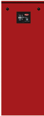
Model #791594 Rotary® Smartlift®