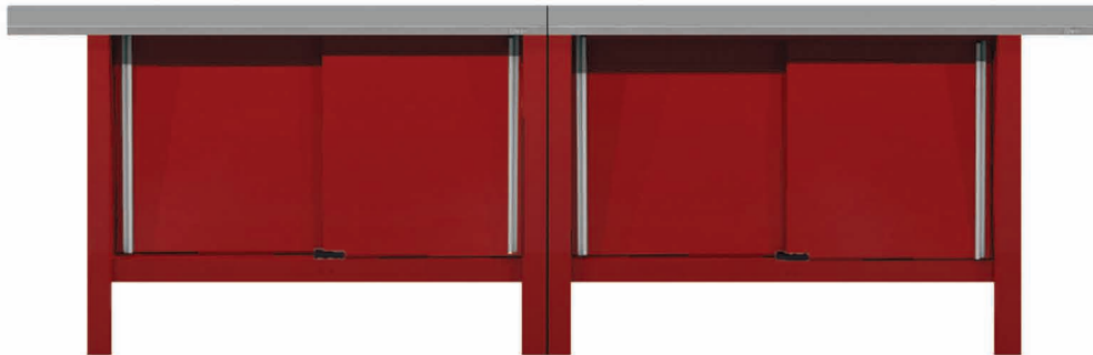
Stationary Double Bay With Left & Right Top Overhang