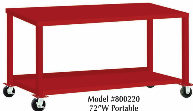
Model #800220 72"W Portable