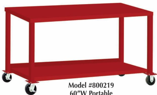
Model #800219 60"W Portable