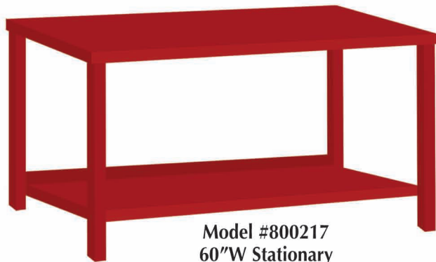
Model #800217 60"W Stationary