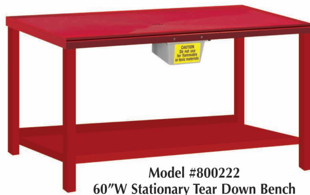
Model #800222 60"W Stationary Tear Down Bench