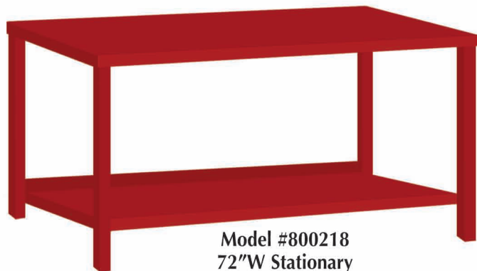
Model #800218 72"W Stationary