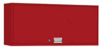
Model #791745 - 45 3/4"W