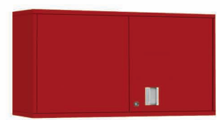
Model #791644 - 30"W