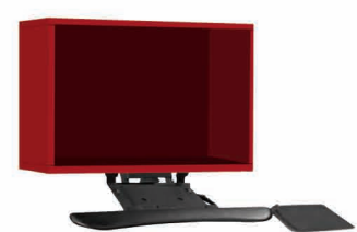
Model #791438 - 24"W