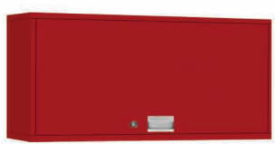
Model #791442 - 36"W