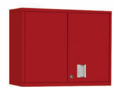
Model #791641 - 24"W