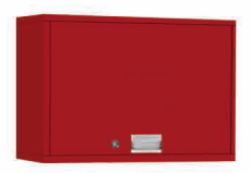
Model #791595 - 24"W