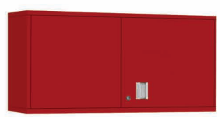
Model #791642 - 36"W