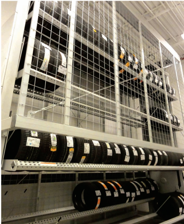
Optional Security Gate

Versatile Shelving Solutions With Endless Configurations!