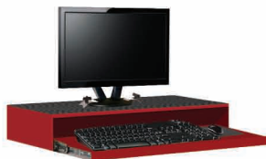
Model #791584 Bench Top Technology Center