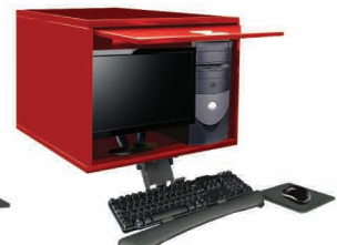
Model #791515 Wall-Mount Technology Cabinet