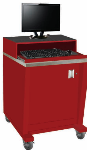
Model #791583 Portable Technology Center