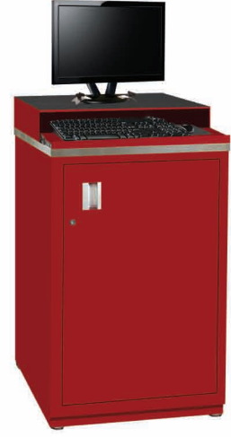
Model #791652 Stationary Technology Center