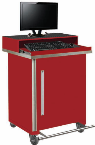
Model #800015 Mobile Technology Center