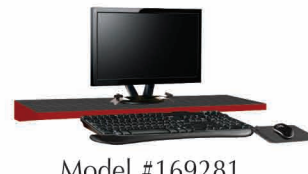
Model #169281 Wall-Mount Technology Shelf