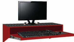
Model #169280 Wall-Mount Technology Shelf