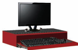
Model #791597 Bench Top Technology Center