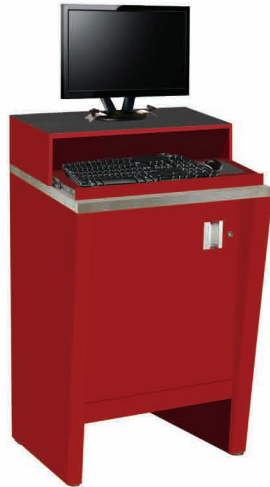
Model #791579 Stationary Technology Center