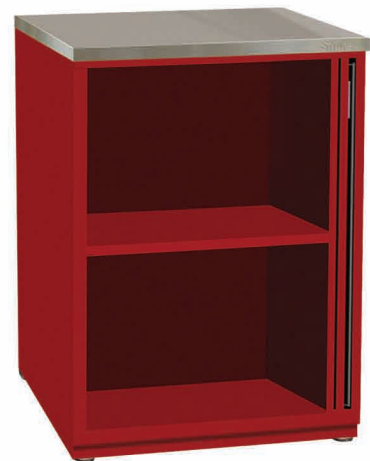
Interior View Of Slide-Out Pocket Door