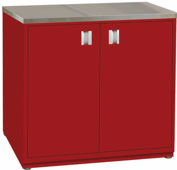
Model #DPDS-36 Double Pocket Door