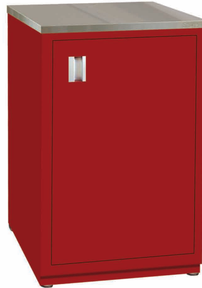
Model #SPDS-24 Single Pocket Door