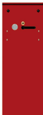
Model #791618 Challenger AquaVantage™