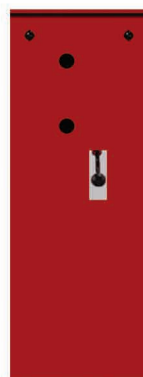
Model #791487 Rotary® Mechanical