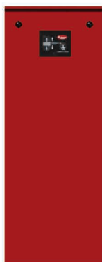
Model #791594 Rotary® In-Ground