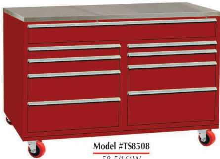
Model #TS8508 58 5/16"W