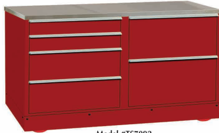
Model #TS7092 58 5/8"W, Concealment Skirts