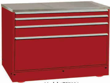
Model #TS7091 43 1/2"W, Concealment Skirts