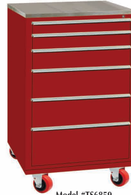
Model #TS6859 29 1/4"W