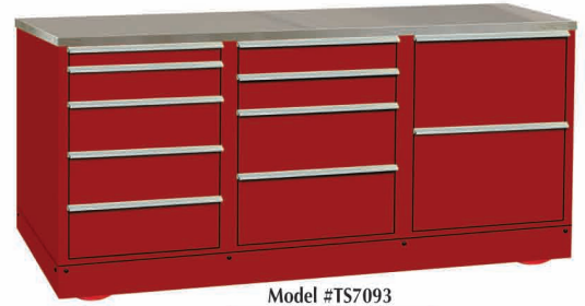
Model #TS7093 70"W, Concealment Skirts