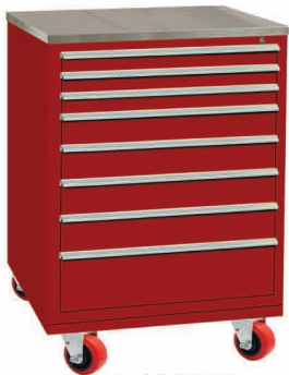
Model #TS8507 29 1/4"W