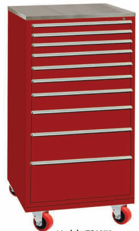
Model #TS6878 29 1/4"W