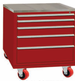
Model #TS6877 29 1/4"W