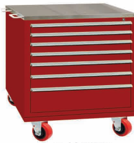
Model #TS8035 29 1/4"W, (2) Side Handles