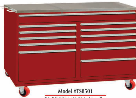
Model #TS8501 58 5/16"W, (2) Side Handles