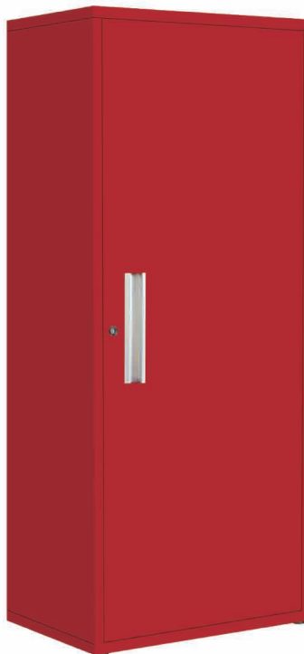
Model #310201 RH RH Mount Door