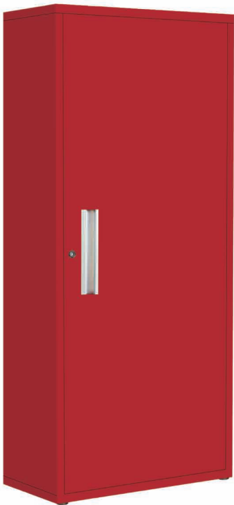
Model #310180 RH RH Mount Door