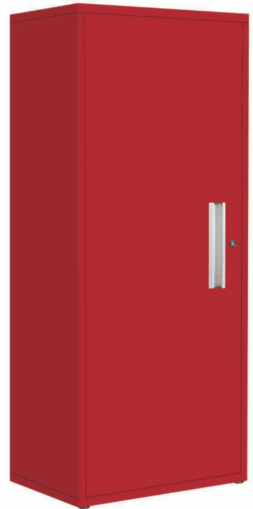
Model #310201 LH LH Mount Door