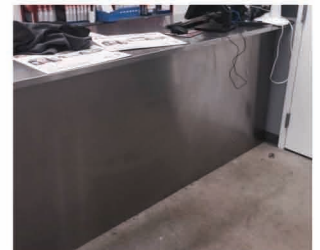
Painted Or Stainless Steel Front Cover Panels Available - Sold Separately