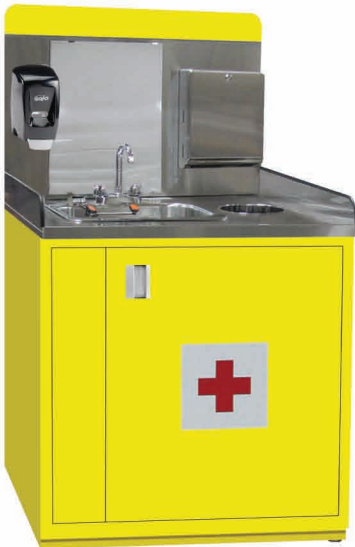
Model #811164 Basic Safety Station