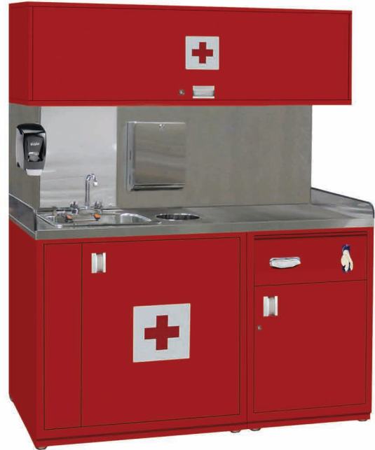
Deluxe Safety Station Shown With Full-Width Upper Cabinet & Glove & Towel Storage Cabinet