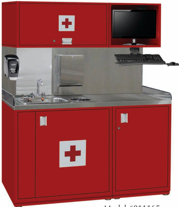
Model #811165 Deluxe Safety Station