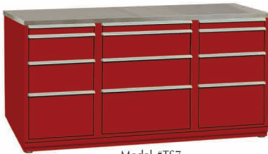
Model #TS7 75"W

All SHURETECH® Stationary Tool Storage Cabinets Include Locking Full-Extension 400lb. Capacity Drawers With Liners. Stainless Steel Over Wood Top Is Sold Separately. Custom Drawer Configurations Available. Height Includes Leg Levelers.