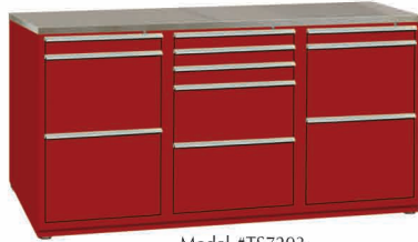
Model #TS7293 69 3/4"W