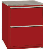
Model #TS8504 29 1/4"W