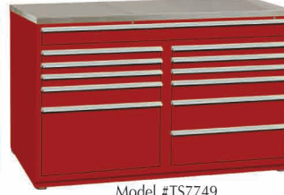
Model #TS7749 58 5/16"W