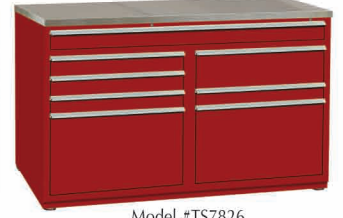
Model #TS7826 58 5/16"W