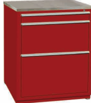
Model #TS8505 29 1/4"W