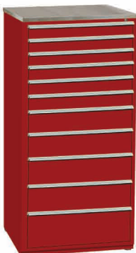
Model #TS8512 29 1/4"W