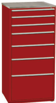
Model #TS8510 29 1/4"W