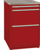
Model #TS8515 23"W