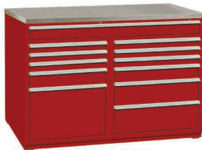
Model #TS7748 52"W