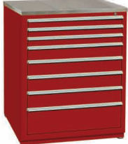
Model #TS7746 29 1/4"W