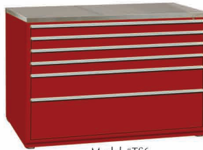
Model #TS6 52"W