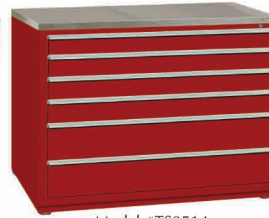
Model #TS8514 46"W, (16) Compartments Per Drawer