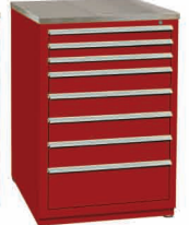
Model #TS7745 23"W