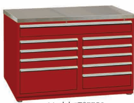
Model #TS7750 45 3/4"W