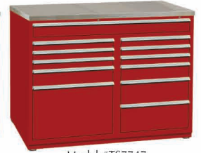
Model #TS7747 45 3/4"W