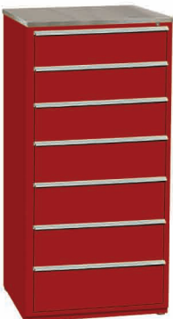
Model #TS8511 29 1/4"W