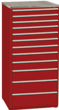
Model #TS8513 29 1/4"W