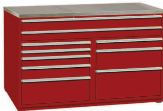
Model #TS8509 58 5/16"W