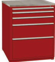
Model #TS8506 29 1/4"W