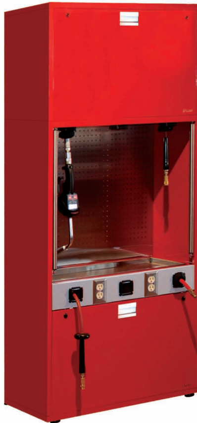
Model #800164 36"W Reel Cabinet