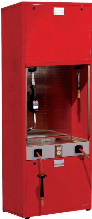
Model #800163 24"W Reel Cabinet