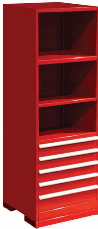
Model #SPS-5 (5) Drawers / (3) Shelves