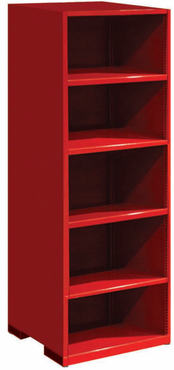
Model #SPS-0 (5) Shelves