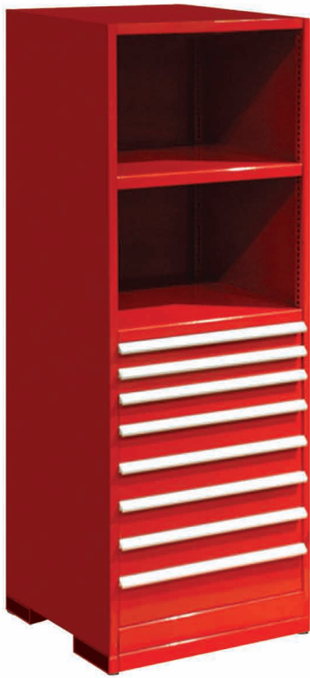
Model #SPS-8 (8) Drawers / (2) Shelves