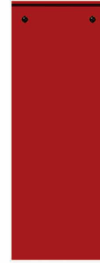
Model #791543 Solid / Plain