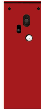
Model #791657 Challenger Mechanical

Used On Shure Hybrid System & TC3® System Workbenches