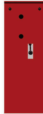
Model #791487 Rotary® Mechanical