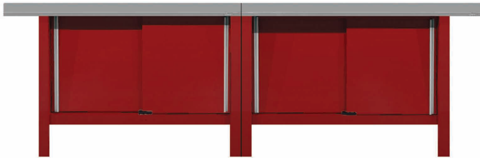
Stationary Double Bay With Left & Right Top Overhang

Available With Rotary® Or Challenger In-Ground Lift Concealment Panels