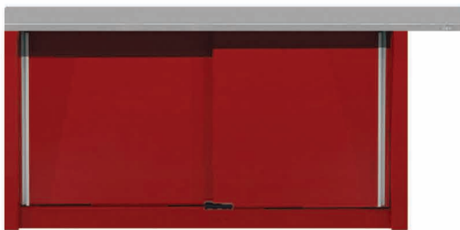
Wall-Mount Single Bay With Right Top Overhang