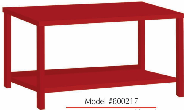
Model #800217 60"W Stationary Workbench