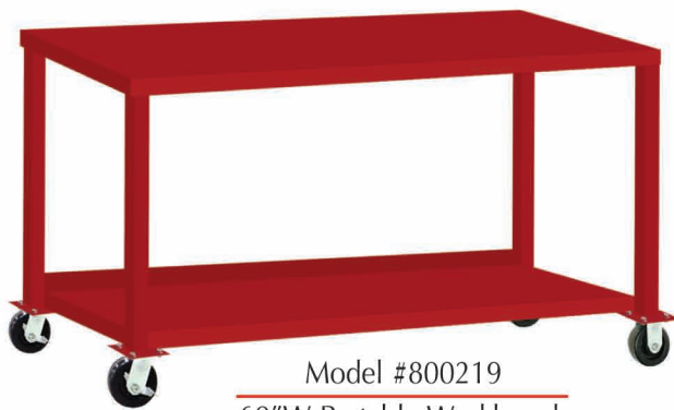
Model #800219 60"W Portable Workbench