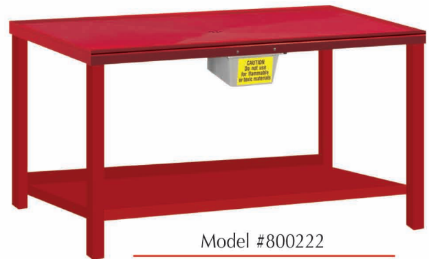
Model #800222 60"W Stationary Tear Down Bench