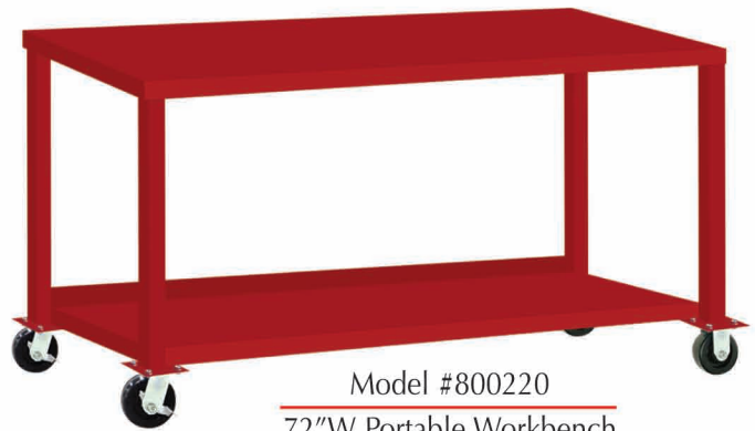
Model #800220 72"W Portable Workbench