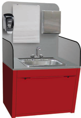
Model #800127 Single Deluxe - Wall-Mounted