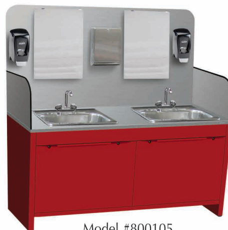
Model #800105 Double Deluxe - Stationary