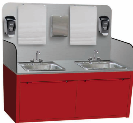
Model #800116 Double Deluxe - Wall-Mounted