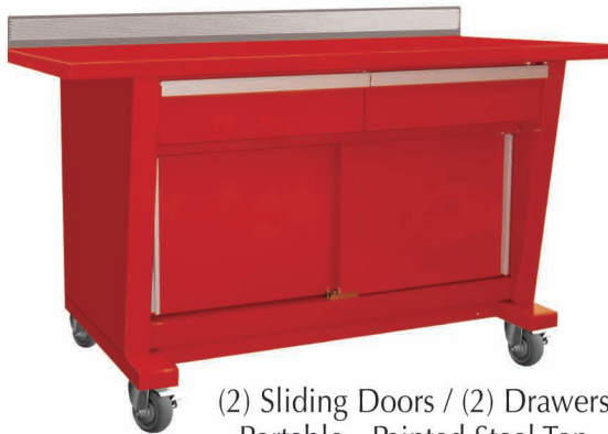
(2) Sliding Doors / (2) Drawers Portable - Painted Steel Top