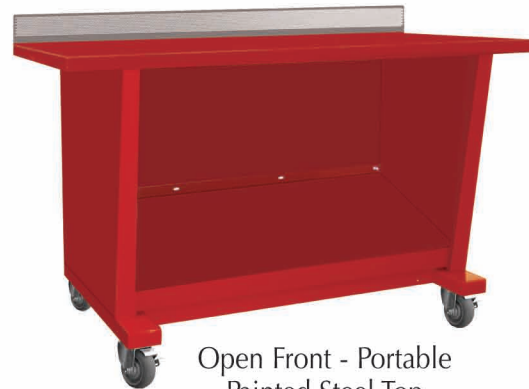
Open Front - Portable Painted Steel Top