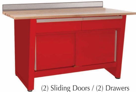
(2) Sliding Doors / (2) Drawers Stationary - Hardwood Maple Top