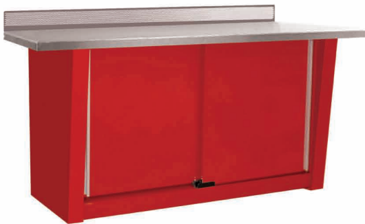
(2) Sliding Doors - Wall-Mounted Stainless Steel Over Wood Top